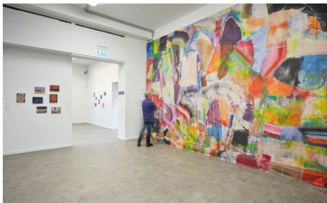
Diana Copperwhite, Onomatopoeia , 2021, oil on canvas, 150 x 180 cm. Limerick City Gallery of Art

Foundation Building, University of Limerick. T: +353 (0) 61 213052 (ext. 3052); yvonne.davis@ul.ie; www.ul.ie/visualarts. Mon-Fri: 9am-5pm. Ongoing: CULTURE SHOCKED! Compilation of 50 original comic-style illustrations celebrating the cultural diversity of UL's community as the institution celebrates its 50th anniversary. Works centred on themes of UL culture, language, dress, food, customs, gestures and superstitions.